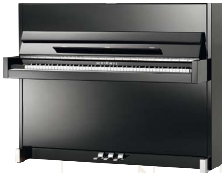
C 116 Modern

Sometimes less is more: That is how the new model C 116 Modern, designed in cooperation with two designers, makes a statement. The first instruments of this style were made in the early 20th century. New production methods and materials – such as the aluminum which forms a counterpart of the polished ebony finish – and the absolute reduction to a minimum create the feeling of purism. The focus on the vertical line lets this model seem to be much taller than it is.